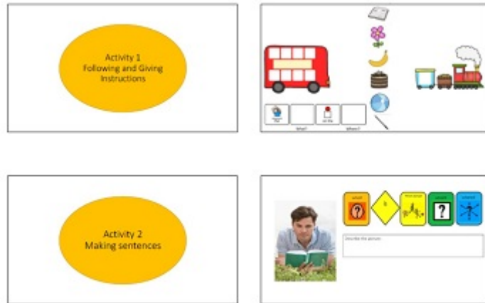
Speech and Language Therapy

This half term, the Speech and Language Therapy department have been busy supporting families to facilitate and promote student’s communication skills at home. This includes contacting parents to offer advice and strategies, liaising with teachers, writing programmes and modelling therapy techniques.